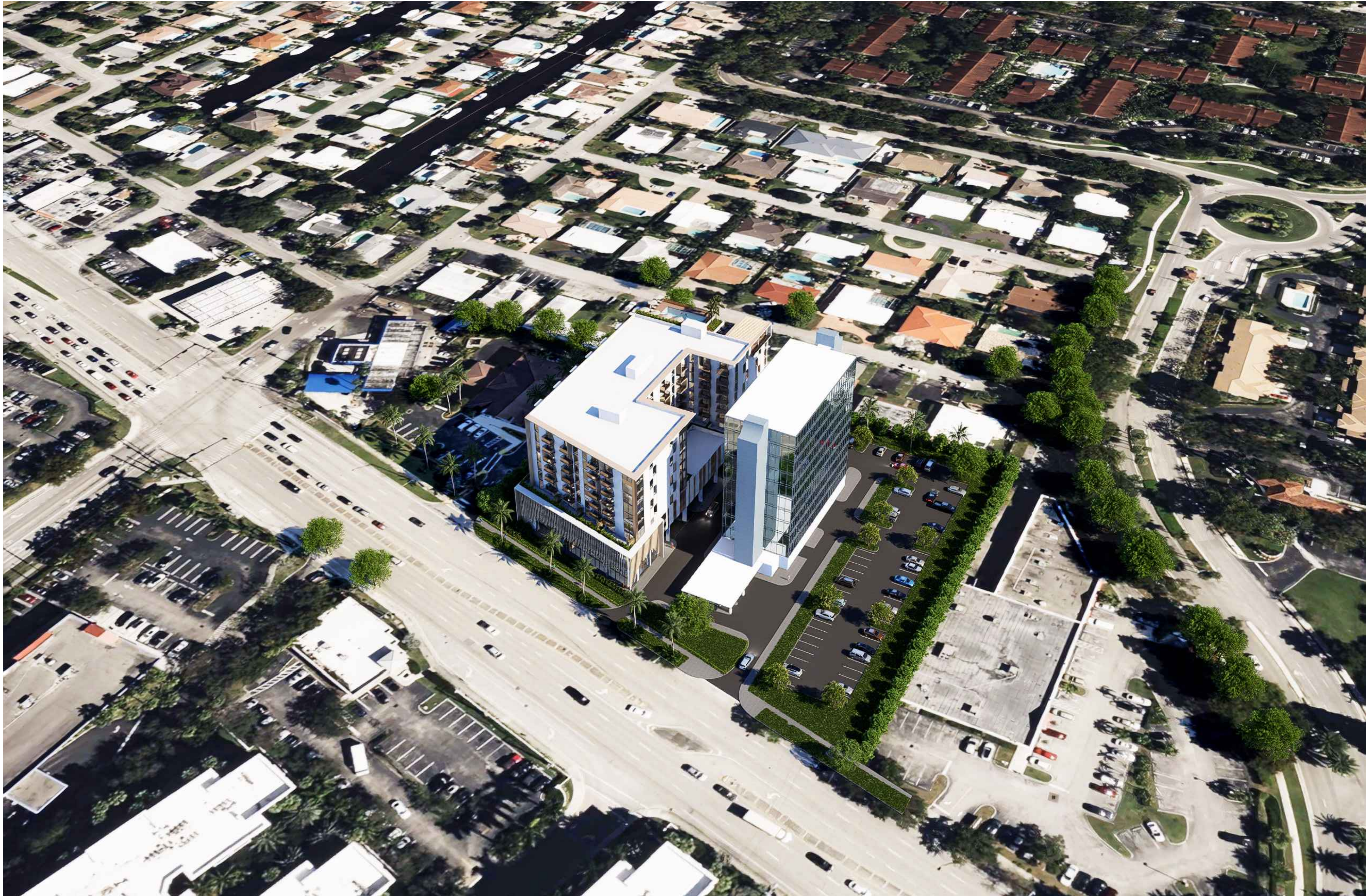
AREA VIEW LOOKING NORTH EAST